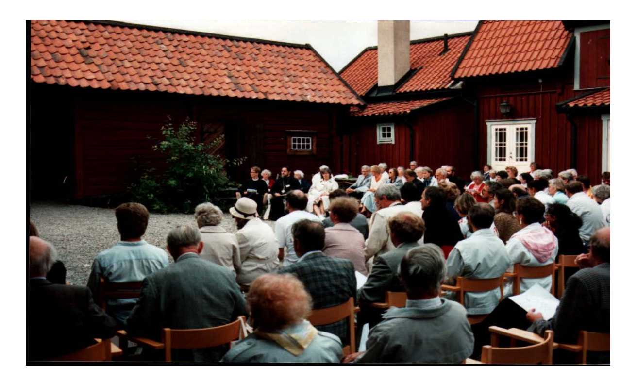
An impression of the Assembly in Soedertaelje

(...) Finally, the Committee is well aware of the fact that the European intergovernmental bodies are playing an increasing role in the preparation of migration policies. For that reason the Committee will profit from its position as an international organisation. It will represent the churches' concern at the various international and governmental institutions."