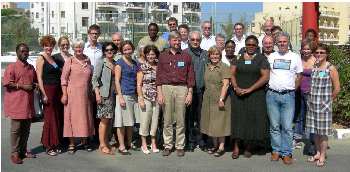
General Assembly of CCME, Protaras 2008

17 th CCME General Assembly Protaras, Cyprus 8-11 October 2008