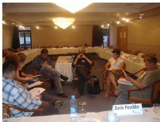
CCME GA Working Group

As a title the group proposed: " Respect across borders " explaining that there are different kinds of borders like intellectual – intra-church – personal – psychological – borders of fear – of hospitality – ... so it might be a very flexible title. In a calendar members can indicate their activities, events, UN and other international days, dedicated day and religious festive days. The group amended this to the draft version.