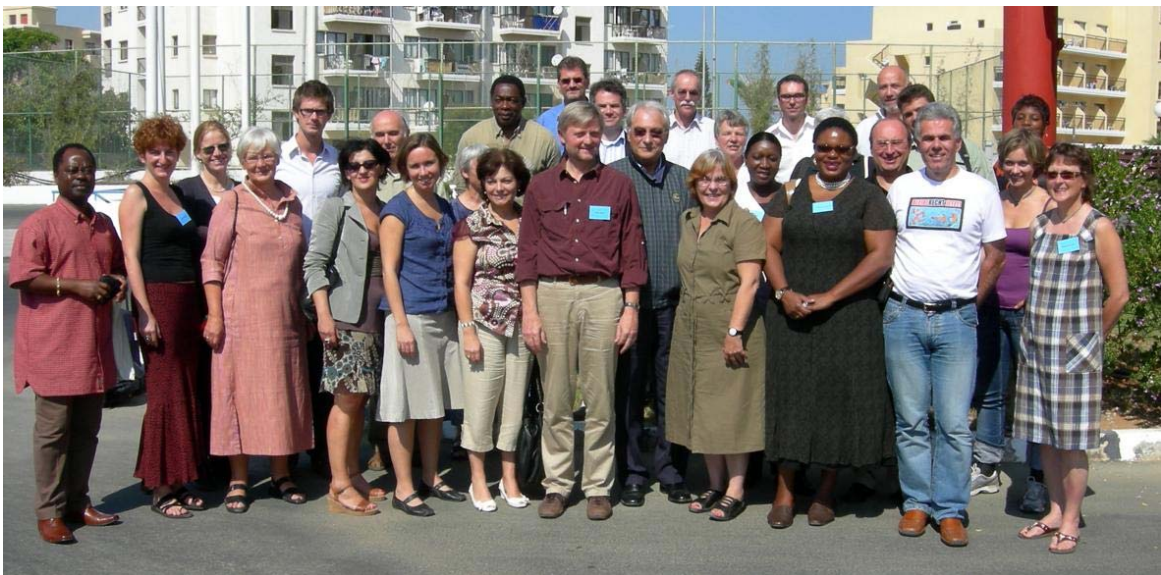
General Assembly of CCME, Protaras 2008