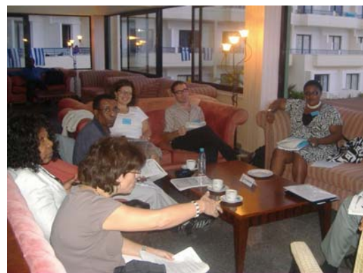
CCME GA Working Group

The following discussion again focussed on the problem that priorities had not been identified clearly among the different areas of work. Several speakers however highlighted that this was due to the broadness of CCME as an organisation. It was noted that the term “merger” of CEC and CCME should be avoided and replaced with “integration”.