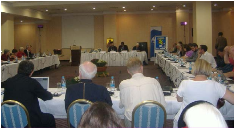
Conference "Churches addressing Trafficking in Human Beings"