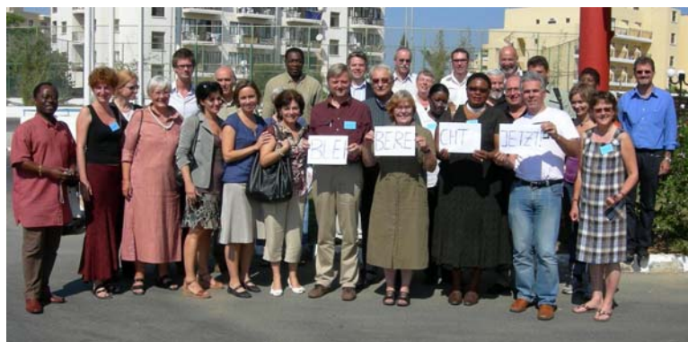
CCME GA expressing their support for the resolution

This resolution was sent by Austrian NGO's to the Austrian government on the occasion of October 10 2008 as "National Right of Residence Day". Doris Peschke pointed out that the central demand of the resolution is accordance with a CCME position adopted at the general