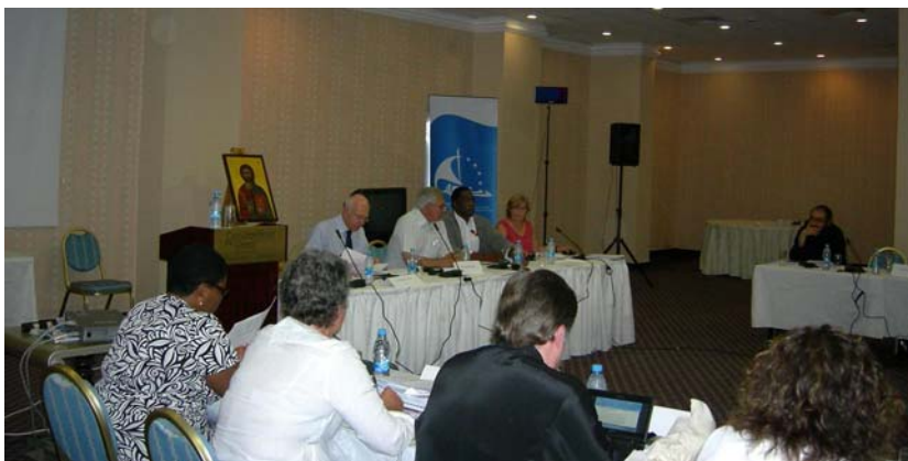
Joint Session of CCME GA and CEC CC