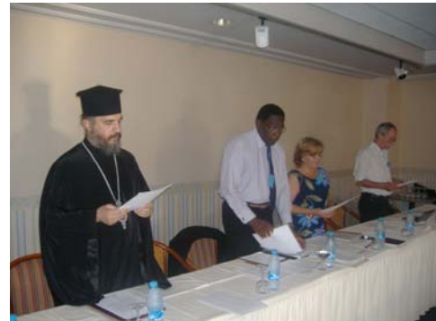
His Grace Bishop Porphyrios of Neapolis

The assembly was welcomed by His Grace Bishop Porphyrios of Neapolis, representative of the Church of Cyprus, who conveyed greetings of Archbishop Chrysostomos II. His Grace led the assembly in prayer and wished it success in the deliberations.