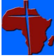
All Africa Conference of Churches