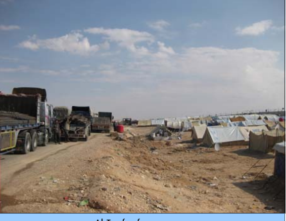
Al Tanf refugee camp

The participants of the delegation who are part of NGOs from USA, Australia, Canada, Czech Republic, Belgium, the Netherlands and Malaysia were shocked to see the poor situation these refugees are in. They live in tents in the dessert, extremely hot in summertime, and freezing cold in winter. There is lack of fresh water and sanitation facilities. We saw piles of rubbish throughout the camps.