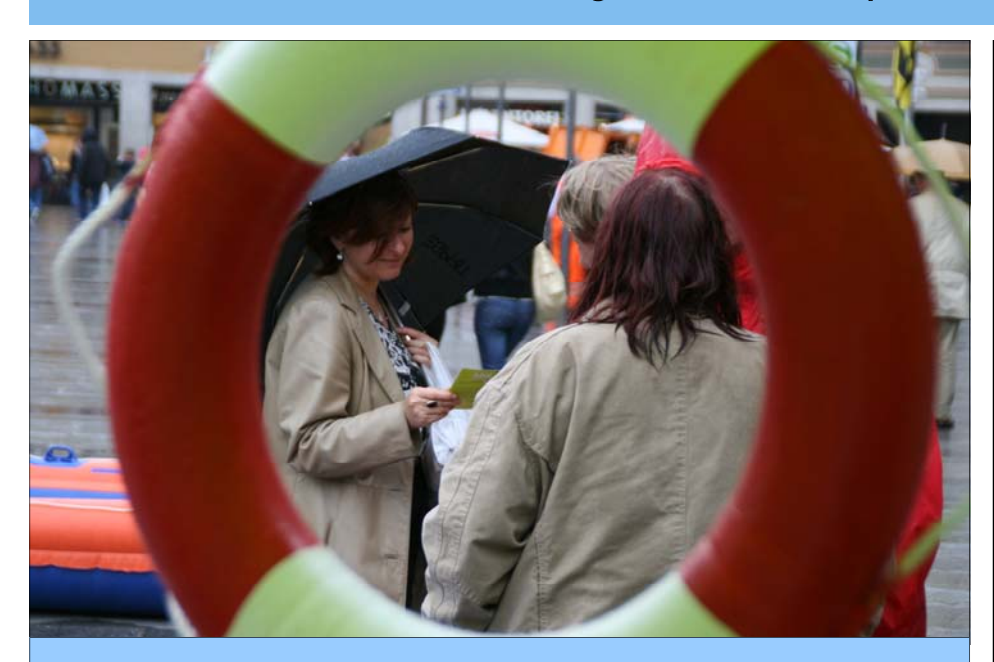
"Save me" visualised: Marienplatz Munich

paign is successful first of all because of its impact on activating support for refugees and putting the theme on the agenda. It becomes clear that commitment and engagement for refugees is widely spread and much higher on the level of civil society than on the level of politics.